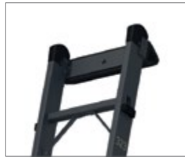
Rubber end cap