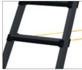
Padding on front tread edges