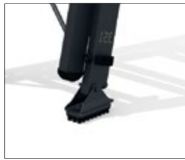
Pivot foot with integrated ground spike