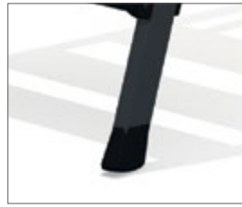
Slip-resistant end caps