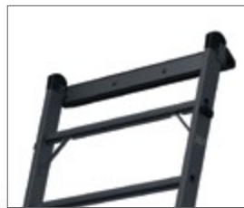
Rubber end cap