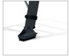
Pivot foot with integrated ground spike