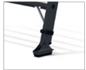
Pivot foot with integrated ground spike